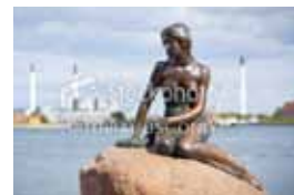
THE LITTLE MERMAID